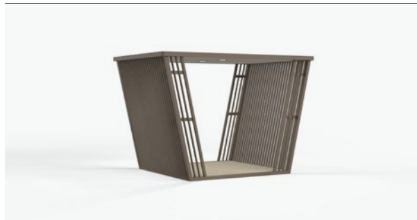
295-20 - KABANNA FRAME