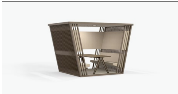
295-18 - KABANNA WITH BACK PANEL