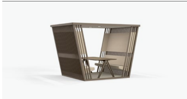
295-17 - KABANNA WITHOUT BACK PANEL